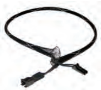
Wire Harness Part Number: 52-2793 QTY: 1