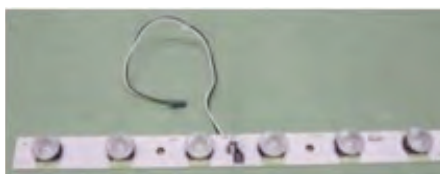
Light Board Part Number: 64-5031 QTY: 1