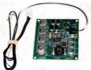
Power Supply Part Number: 64-5034 QTY: 1